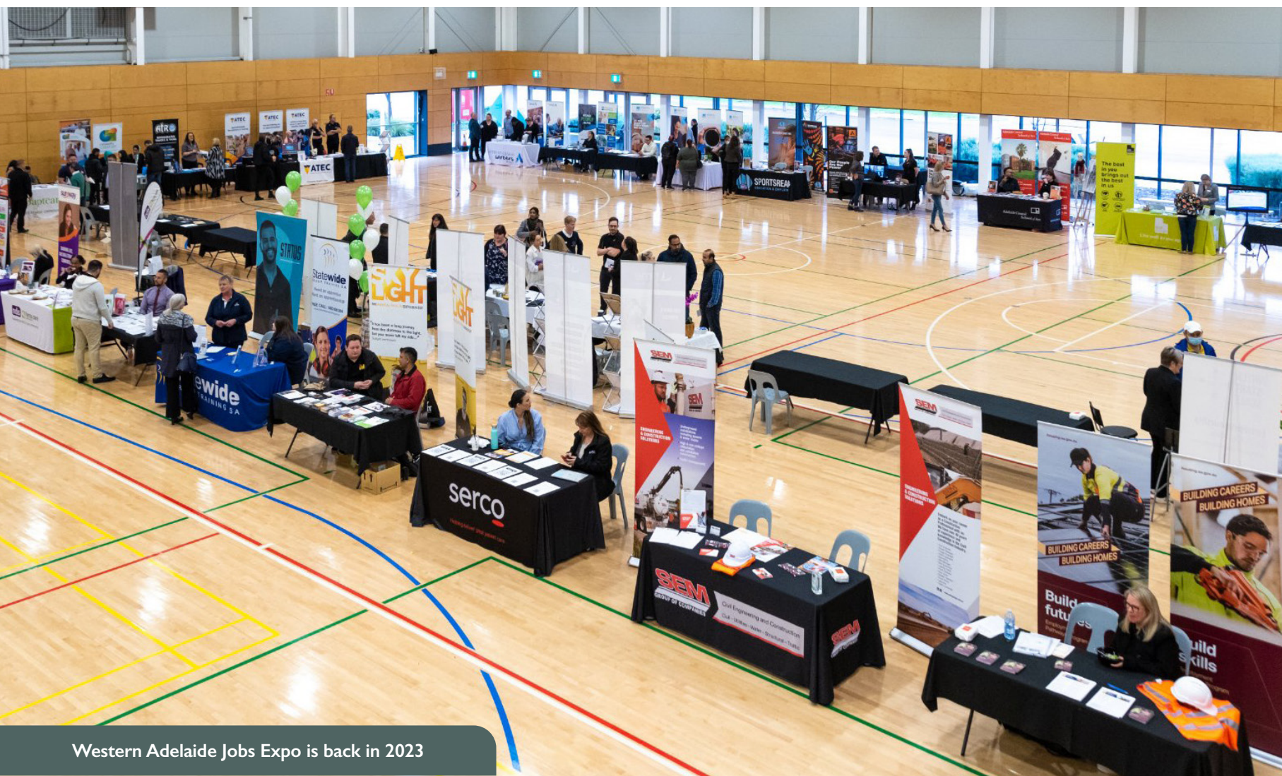
Western Adelaide Jobs Expo is back in 2023