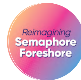
Semaphore Foreshore Master Plan