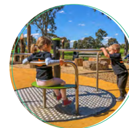
Project Play Upgrade of Playgrounds

Stay informed and engaged with our initiatives by joining the conversation about topics that are important to you. With Participate PAE, our community engagement platform, you can stay up to date and never miss the opportunity to share your feedback and ideas on what's happening in the City of PAE. Discover more about our initiatives and their next steps at participate.cityofpae.sa.gov.au