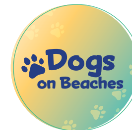
Pups in Public Places Dogs on Beaches