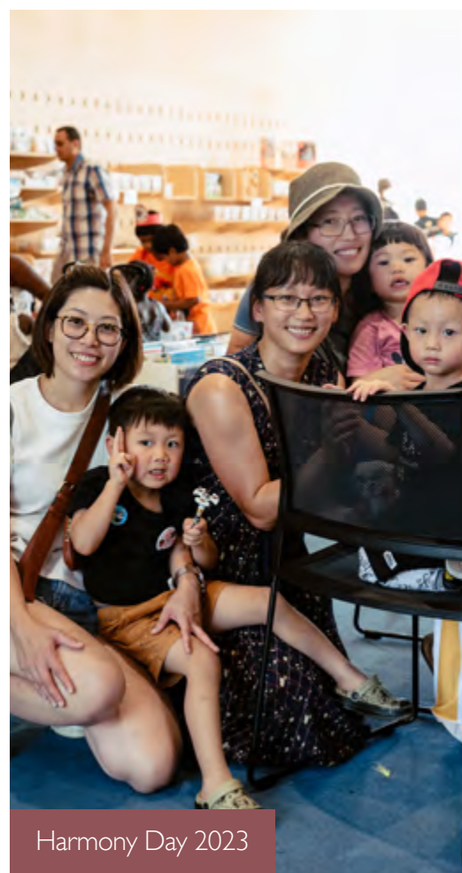
Harmony Day 2023

Library membership is free, and gives you access through the One Card Network to all Libraries in South Australia — so join up, and let your PAE Library card start enriching your life.