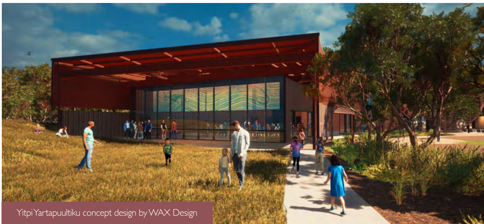
Yitpi Yartapuultiku concept design by WAX Design