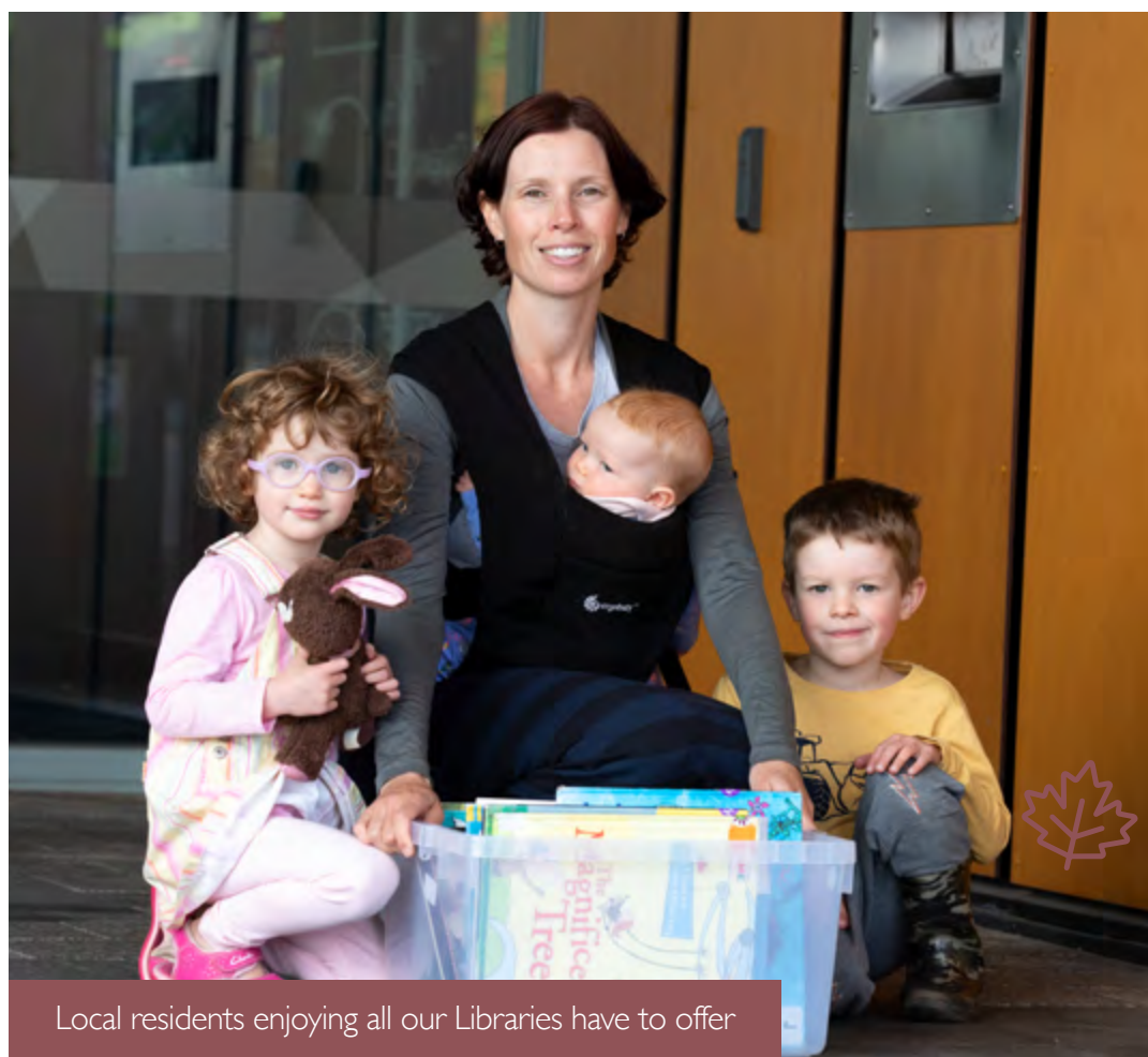
Local residents enjoying all our Libraries have to offer