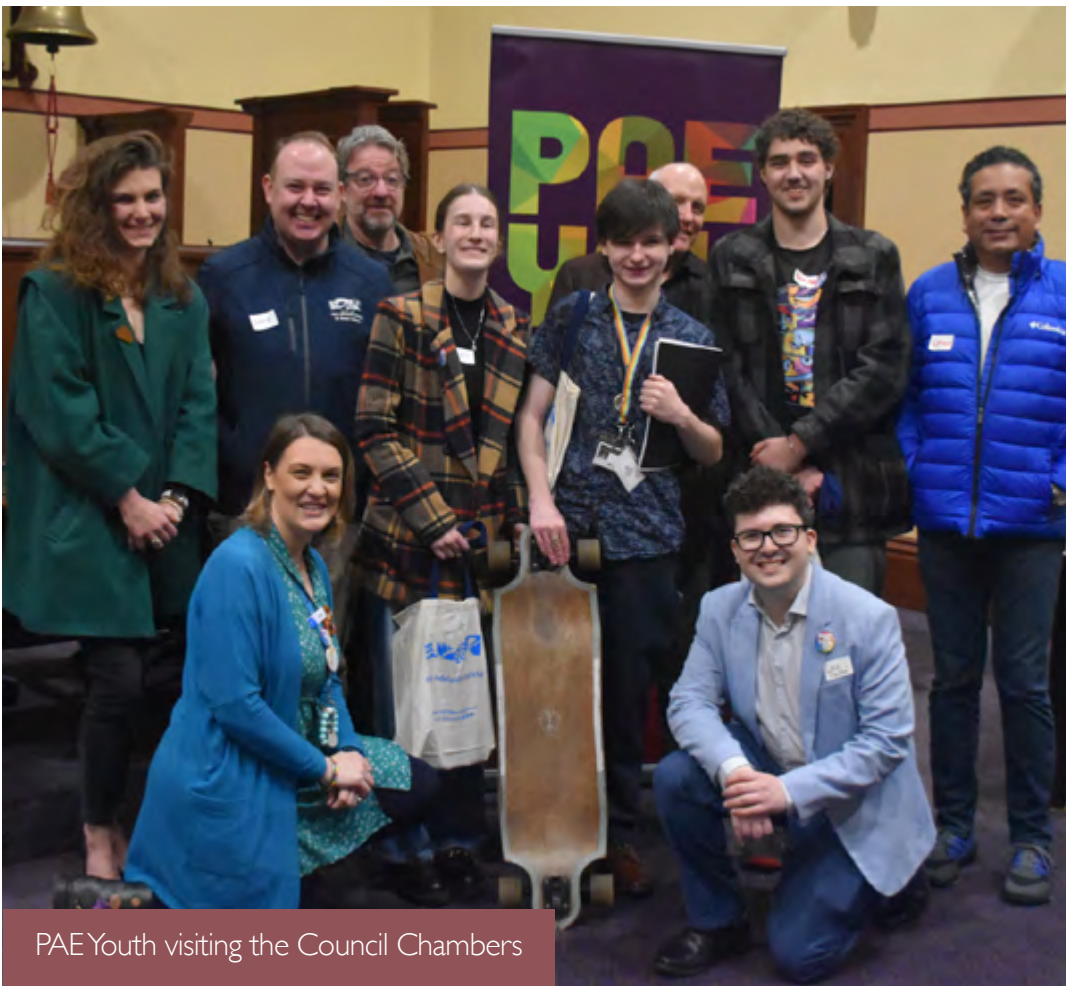
PAE Youth visiting the Council Chambers