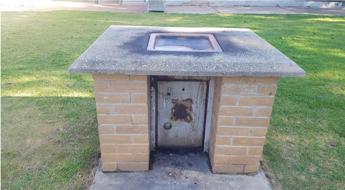
Area 2 – Gazebo and surrounding grassed area