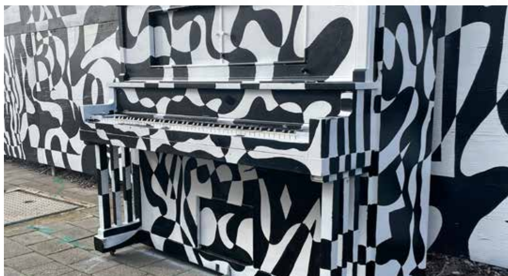
Umbrella Festival | One of the Impromptu Pianos hidden around the Port