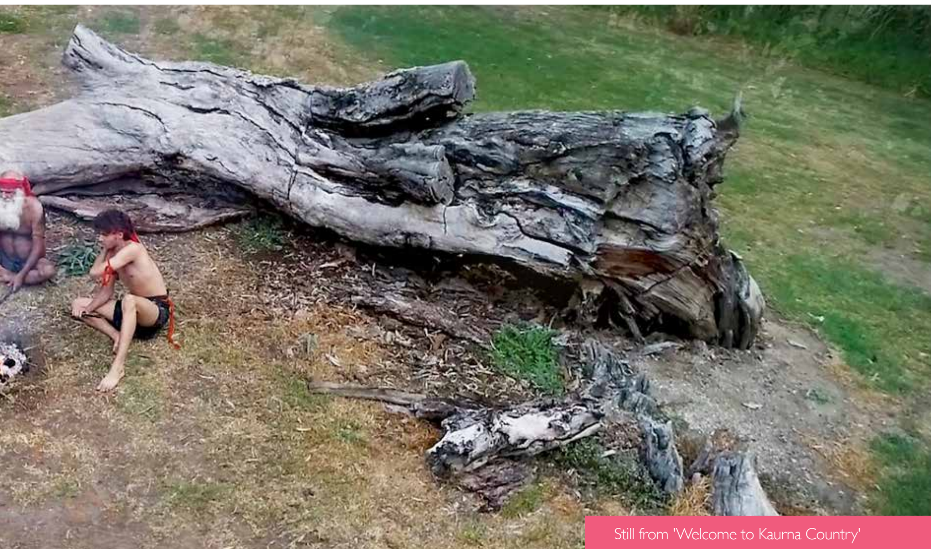
Still from 'Welcome to Kaurna Country'