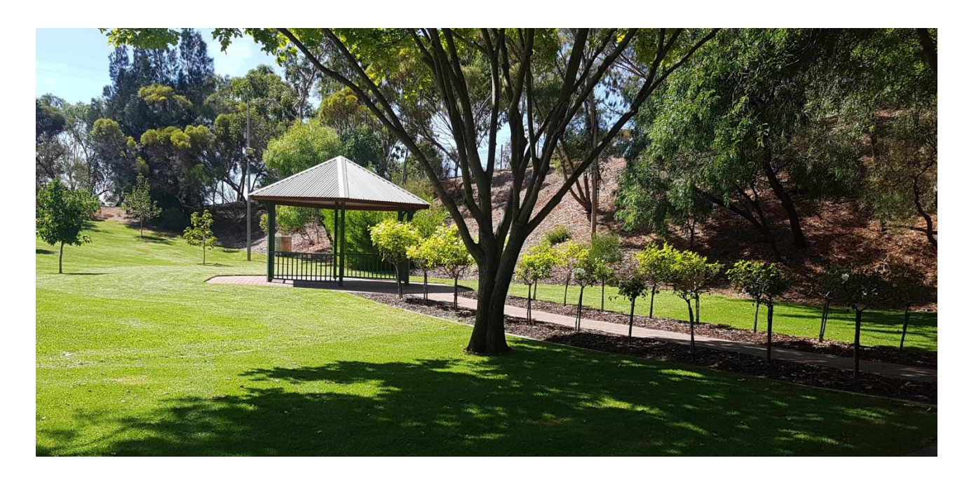
Area 1 – Gazebo & Surrounding Area (Must be booked)