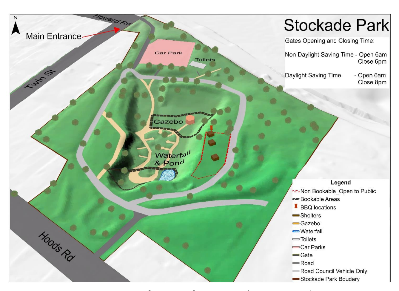
Two bookable locations - Area 1 Gazebo & Surrounding / Area 2 Waterfall & Paved area