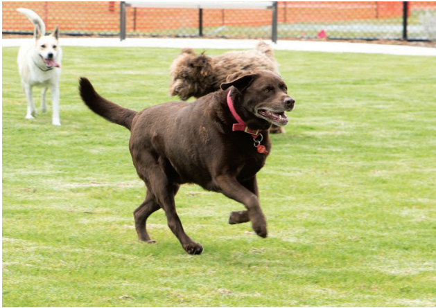
On-leash, Off-leash & Dog Prohibited Areas