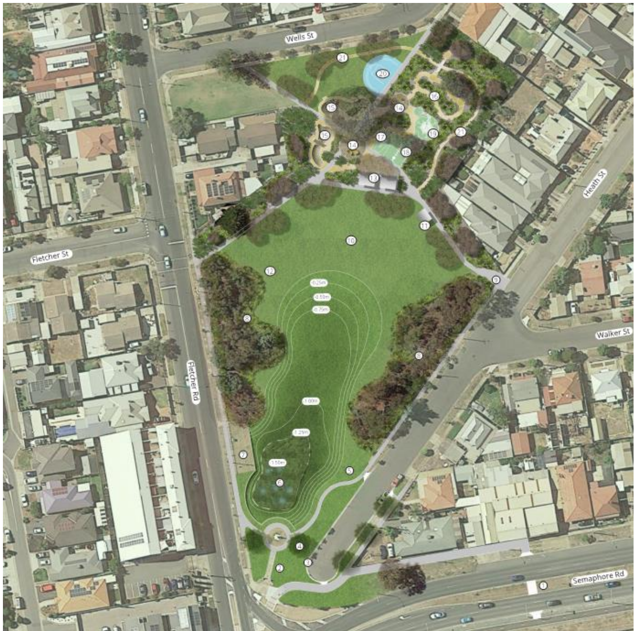
Figure 1 – Location plan and concept

The three themes that were mentioned most by the respondents were; the need to maintaining useable open space, utilising native planting and recognising the Aboriginal heritage of the area. Further information is provided in Table 1.